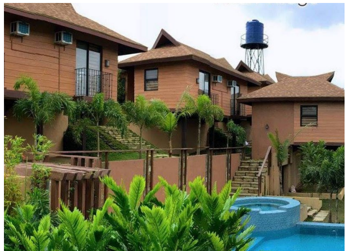
Asian Village Tagaytay