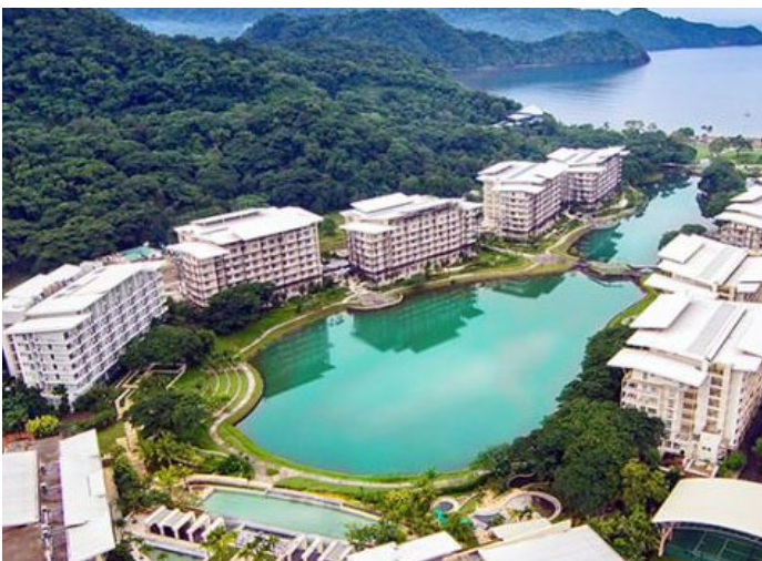
Pico De Loro