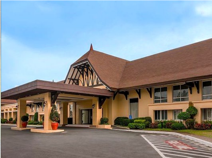
Taal Vista Hotel