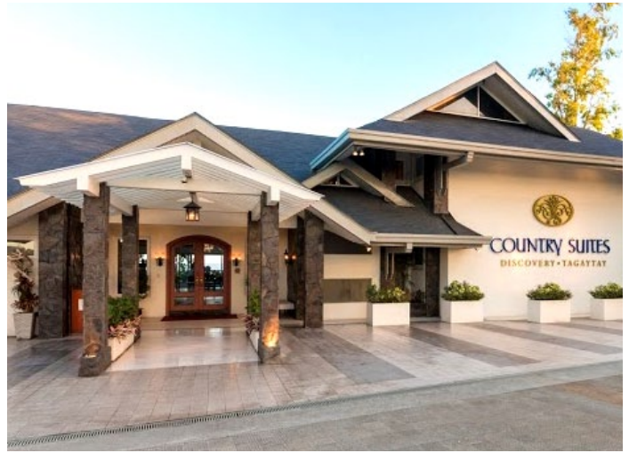
Discovery Country Suites